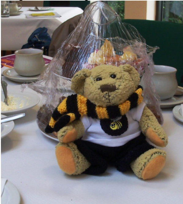
[Jack at the Afternoon Tea at the Whitworth Centre]

Jack the Bear is our mascot and we have lots of little bears like him for sale for £6.50. They are lovely and soft and wear a T-shirt with a bee motif and a lovely woolly scarf. If anyone would like to own Jack, please contact us on 01246 380415 . We always take him along to our meetings too.